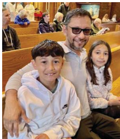
Photos from June 3/4 Weekend Masses